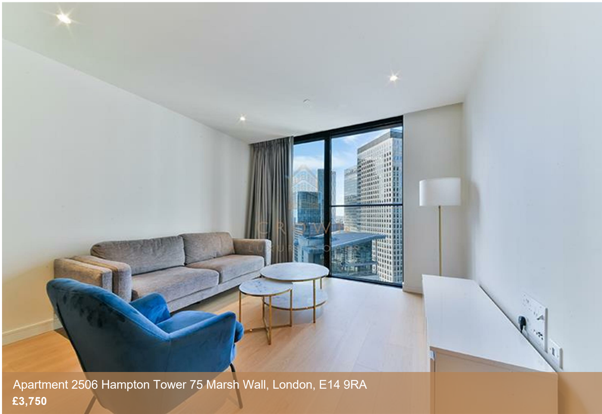
Apartment 2506 Hampton Tower 75 Marsh Wall, London, E14 9RA £3,750